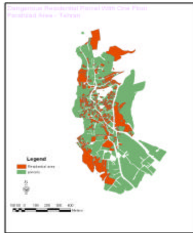
Fig.1: Map of one floor residential building that are in danger of earthquake