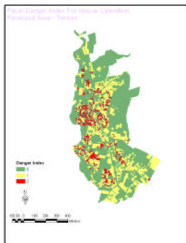
Fig. 3: Map of road obstruction